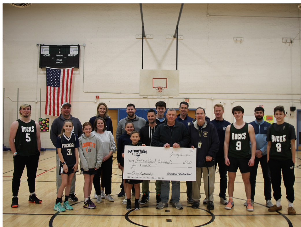
The PIP Fund proudly supported the Foxborough Youth Basketball Program with a grant of $500 to help keep registration costs low for participating families, as well as cover registration costs for families in need.