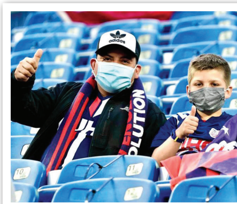
Fans returned to the Gillette Stadium stands for the first time in 412 days to enjoy the Revolution home opener against D.C. United on April 24.

While you've been away, we've made some big home improvements. Notable infrastructure updates for the 2021