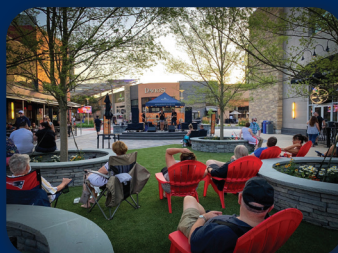
The stage will feature performances from local musicians all summer long.