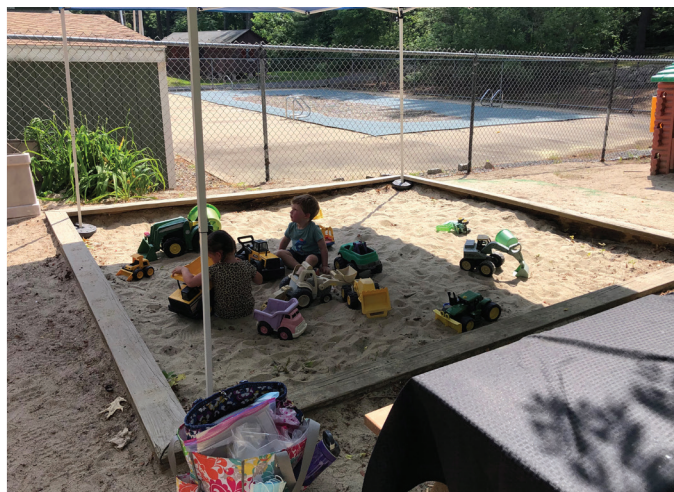
Part of the $6,200 grant to Foxboro Rec covered the cost of playground sand.

Interested participants can pick up a passport at the Boyden Library, Town Hall, Lane Learning Center and the Senior Center. These detailed passports will enable visitors to answer questions, explore the trails and create artistic field notes and sketches during their visit. The program made its grand opening on June 26 at the Lane Learning Center and there will be opportunities throughout the summer to utilize the passport individually or through guided family scavenger hunts in partnership with the Boyden Library.