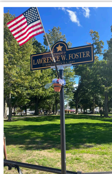
The first set of these new veteran markers have already been installed around town.

their replacement. The Foxborough Historical Commission is working on replacing these markers, selecting a newly designed sign featuring the applicable war and branch of service for each veteran and working with the community to raise the requisite funds to replace these markers. The PIP Fund is proud to be a part of these important efforts, granting the Historical Commission $1,500 to help offset the cost of these new town square markers. With this grant and contributions from the Foxborough community, the Historical Commission recently raised the requisite funds to replace all 29 markers. The first 10 markers have already been received and are in the process of being replaced. The remaining replacement markers have also been ordered, with the goal to have all the new markers in place by Memorial Day.