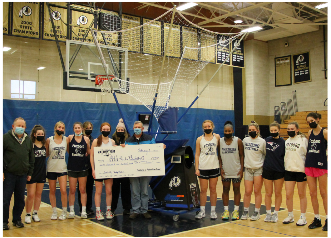
The PIP Fund granted the FHS Girls Basketball team $7,200 to purchase the Gun 10K by Shoota-Way shooting machine.

group like the PIP Fund in your backyard so if needed, you can ask them for help," Downs said. "They can always say no, but we've been very fortunate in that we've asked twice in my 11 years and they've said yes twice. This type of outside support lets the team know that there's people backing them and rooting for them."