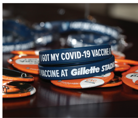
Gillette Stadium is proud to serve as the state's largest vaccination site, administering more than 7,000 vaccines per day and over 250,000 total.

Phase IV enables large capacity venues throughout the state to welcome fans back in 2021, and marks an important step toward a return to normalcy for Patriots and Revolution fans across the region, including the Foxborough faithful, who we know are eager to once again cheer on their hometown teams from the Gillette Stadium stands.