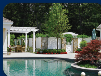
Guests can transform their space with the help of Walpole Outdoors.

Located in the North Marketplace next to the Patriots ProShop Collection, Walpole Outdoors will offer guests everything they need to design and enhance their outdoor space, with premium fencing, pergolas, garden décor and more. Featuring a showroom and design consultants on site, this new location will provide guests with the resources to upgrade their outdoor