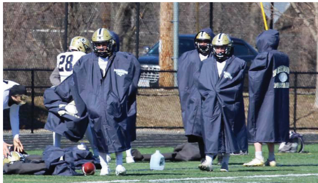
The Foxborough High School football team show off their new weatherproof sideline capes sponsored by the PIP Fund.

Foxboro Recreation is teaming up with the Department of Public Works, Commission on Disability and Historical Society to install a