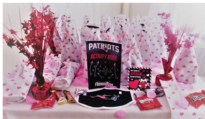
To brighten spirits, the Patriots delivered Valentine's Day gift bags to the Doolittle Home.