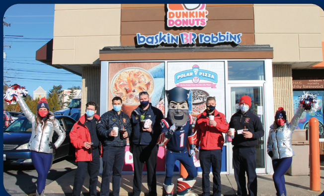
Foxborough Fire Department's Group 3 were among the guests greeted by Pat Patriot and the cheerleaders during Random Acts of Kindness Day.